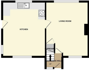
GROUND FLOOR 419 sq.ft. (38.9 sq.m.) approx.